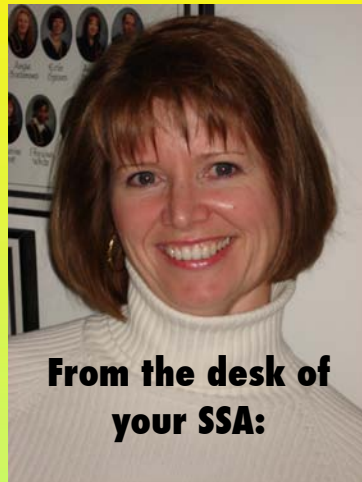
From the desk of your SSA: