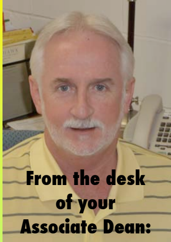
From the desk of your Associate Dean:

Welcome to the School of Human Services!