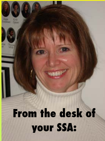
From the desk of your SSA: