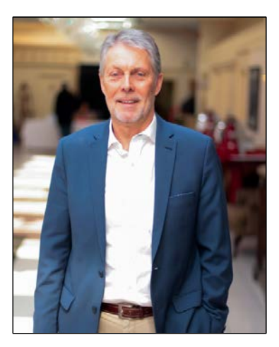
Fred Eisenberger Mayor