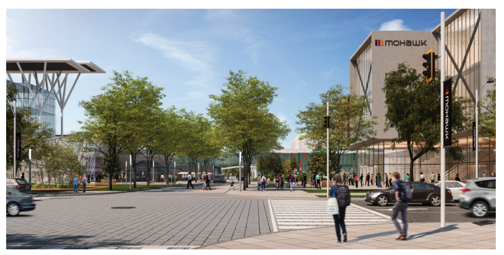
Rendered view of the Central Four Corners Gateway into campus, looking southward along Mohawk Way.