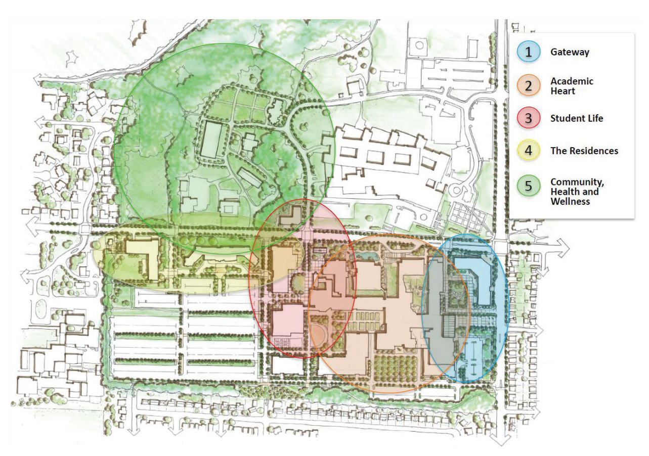
Fennell Campus Neighbourhoods

the campus. The unique features of each area are enhanced and celebrated, whether it is an open space, a building, a heritage feature, or special street. Each neighbourhood can also be defined by specific uses and functions, or by the academic contribution to place - a focus on technology or athletics, or a grouping of residences, a celebration of Indigenous culture, or the primary gateway to the campus. Although each neighbourhood can be defined by the strength of an academic program, it should be designed to reflect and accommodate a mix of uses and programs to build in long term flexibility and to futureproof the campus. Each campus neighbourhood is described below in detail, from east campus to west campus and to the North Lands.