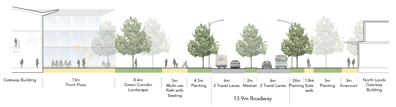
Section-Elevation A-A': Fennell Avenue West, looking west