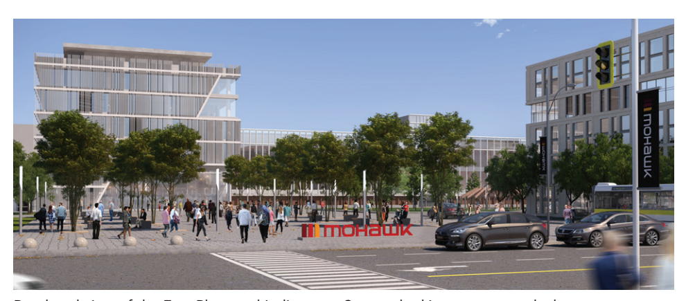
Rendered view of the East Plaza and Indigenous Square, looking west towards the new East Atrium addition onto the C Wing.