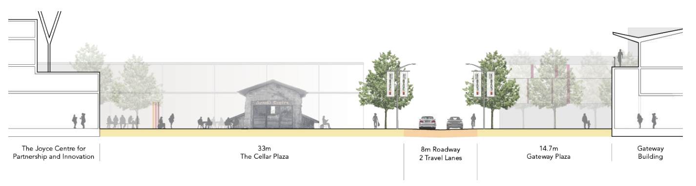
Section-Elevation B-B': Roadway demonstrates typical plaza streets