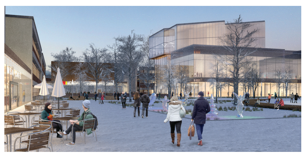
Rendered view of the Central Plaza with Agri-gardens, looking east towards the McIntyre Performing Arts Centre.