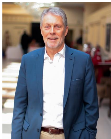
Fred Eisenberger Mayor

A handwritten signature in black ink, reading "Fred Eisenberger".